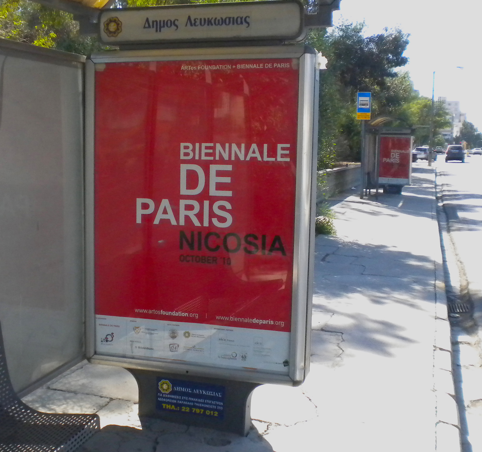
Paris Biennial in Nicosia - Theme: "Reinventing the terminology of art" - Dates: October 19-25, 2010. Partners: Ministry of Culture and Communication, Ministry of Culture and Education of Cyprus, City of Nicosia, International Association of Art Critics (AICA), French Terminology Society, International Organization of La Francophonie, French Cultural Centre of Cyprus, Musée du quai Branly, Artos Foundation, Cyprus University of Technology.