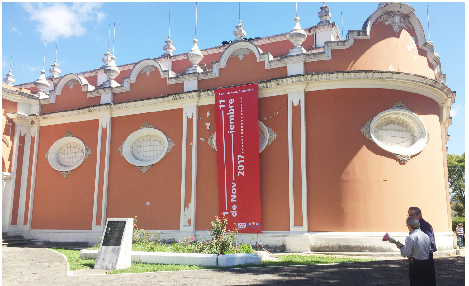
Paris Biennial in Guatemala, 2017. National Art Museum of Guatemala City. Partners: SAISA (Exporting Guatemalan Handicrafts to the World), Centro Cultural de Espana en Guatemala, Museo Nacional de Arte Moderno Carlos Merida, Guatemala, Teatro Nacional - Centro Cultural Miguel Ángel Asturias, Saul Bistro, ANAU (National Archive of Urban Art), Arte Centro - Graciela Andrade de Paiz, Fundacion Paiz Para la Educacion y la Cultura, Cooperacion Espanola, Museo Miraflores, Ministry of Culture and Sports.