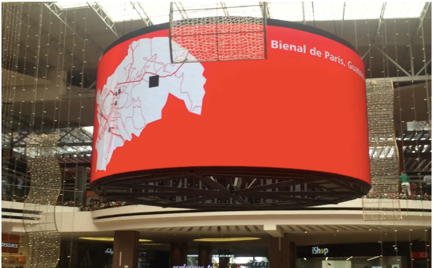
Paris Biennial in Guatemala, 2017. Advertising campaign in the capital city's large supermarket.